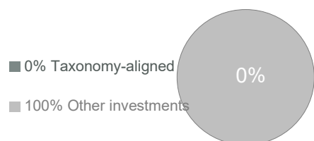
1. Taxonomy-alignment of investments including sovereign bonds*