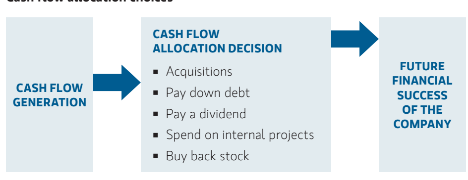
DISPLAY 1 Cash flow allocation choices

For illustrative purposes only.