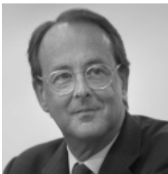
Erskine B. Bowles (67) Director Since 2005