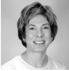
Laura D. Tyson (65) Director Since 1997