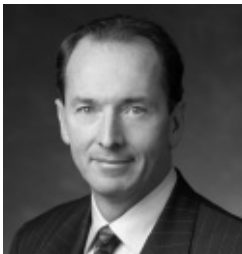
James P. Gorman (54) Director Since 2010

Qualifications, Attributes and Skills: Mr. Glocer's leadership positions, including as Chief Executive Officer of Thomas Reuters Corporation, provide extensive management experience as well as operational and technology experience and international perspective.