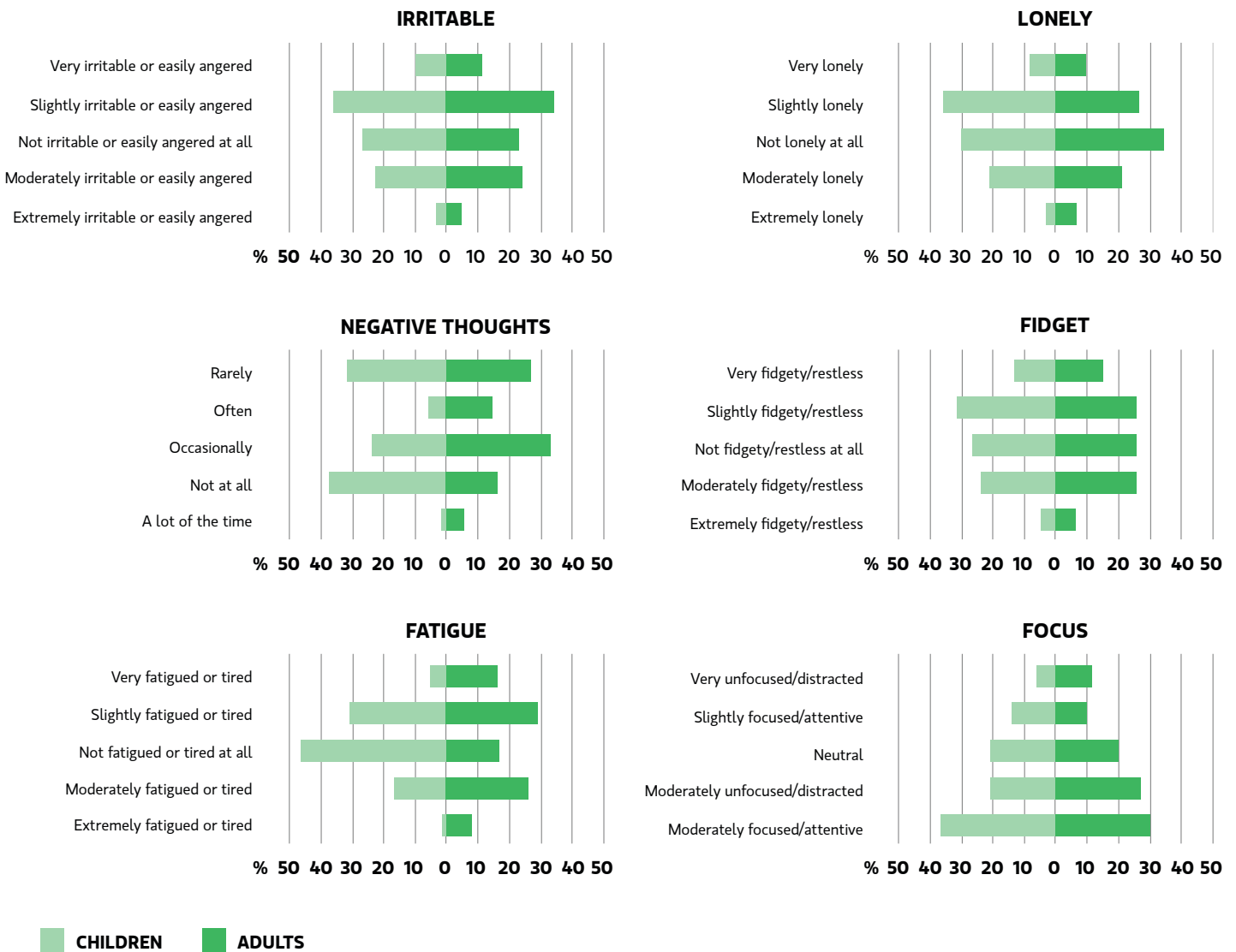
FIGURE 2: Percentage of children and adults surveyed in the U.S. and the U.K. reporting various mood states.