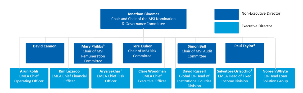
Figure 3: MSI Board of Directors as at 31 December 2020

As at 31 December 2020, the MSI Board was comprised of 13 directors (7 executive directors and 6 non-executive directors). Figure 3 provides an overview of the MSI Board of Directors.