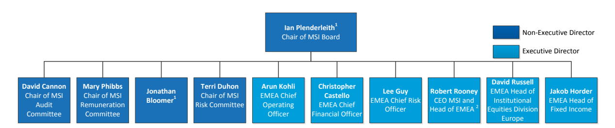
Figure 3: MSI Board of Directors

As at 31 December 2017, the MSI Board was comprised of 11 directors (6 executive directors and 5 non-executive directors). For further details on the MSI Board members including detailed biographies and other directorships refer to Appendix I.