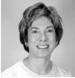
Laura D. Tyson (64) Director Since 1997