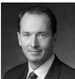
James P. Gorman (53) Director Since 2010