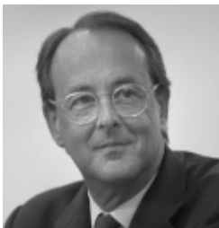
Erskine B. Bowles (66) Director Since 2005